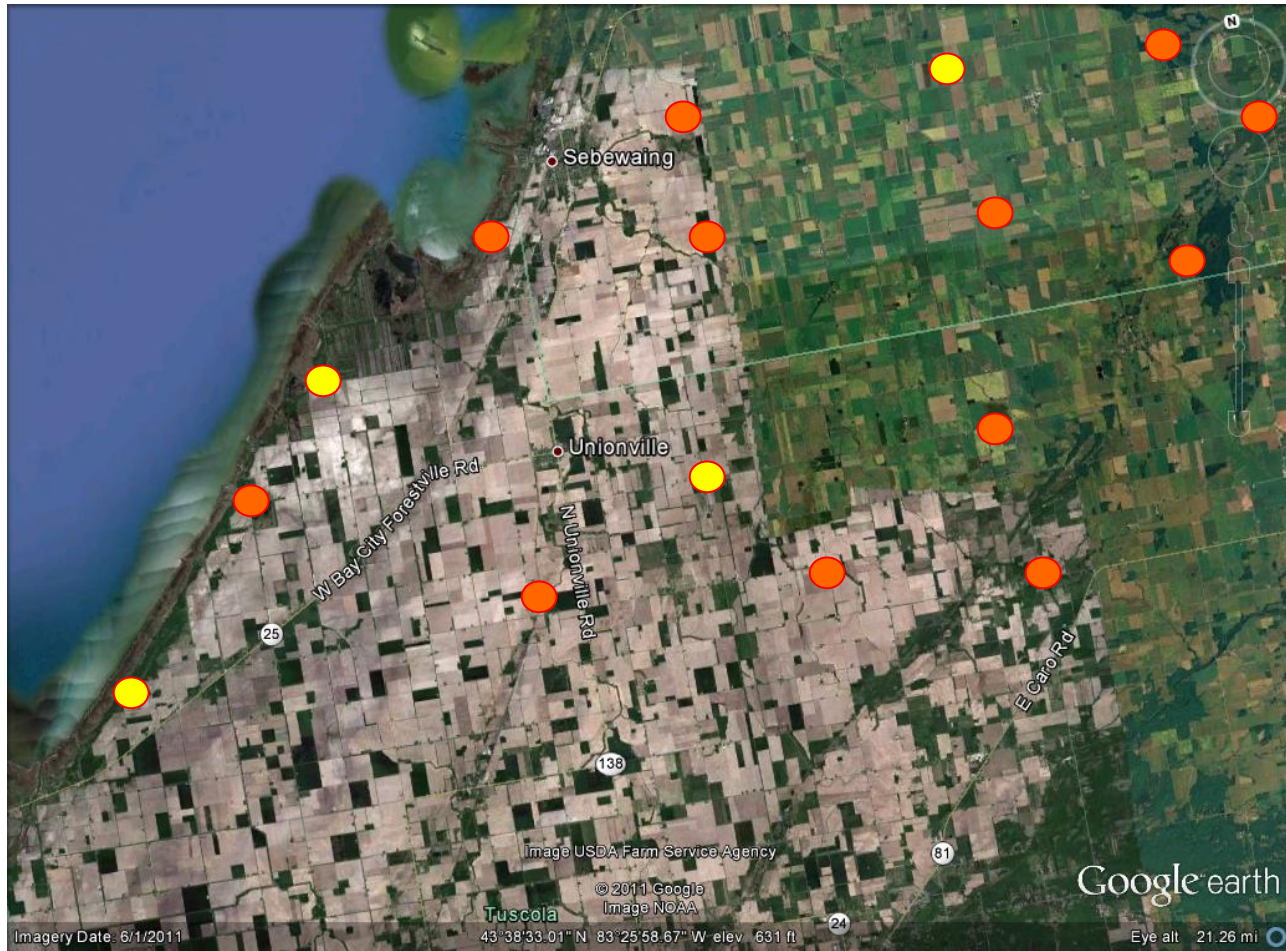
Figure 2. The Crosswinds Project Area in east-central Michigan and is predominantly agricultural lands with some interspersed forested areas. Point count sites were established and surveyed in the fall of 2011 for migrant bird use. Yellow points signify locations where we observed 3 or more species sensitive to the presence of tall structures.