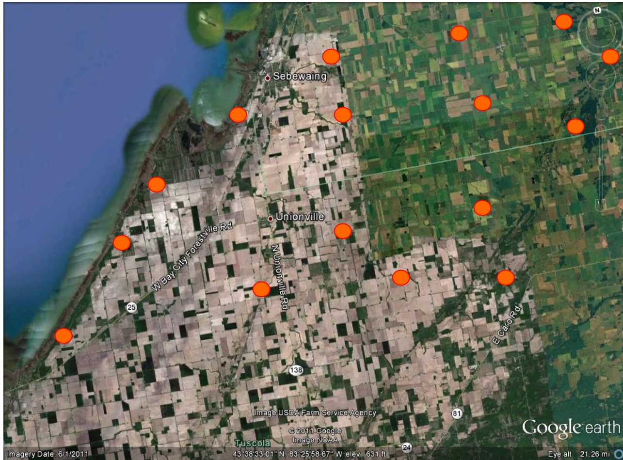
Figure 1. The Crosswinds Project Area in east-central Michigan and is predominantly agricultural lands with some interspersed forested areas. Point count sites were established and surveyed in the fall of 2011 for migrant bird use.

Surveys at point count sites were 7 min. long (after 2 minutes of silence) and conducted between 15 minutes before sunrise and 1030 AM EST. Technicians recorded the following data: date, survey start time, temperature, wind speed, wind direction, cloud cover. Each individual bird observed during a survey was recorded by species, as well as the azimuth to the bird, gender (if known), distance from the observer, estimated flight height (if applicable), and other comments.